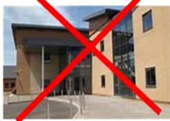
The Hollies in Peterborough